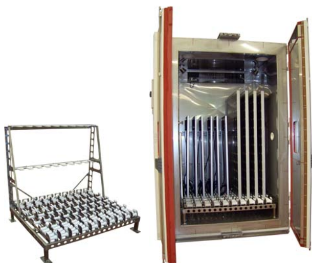
Rack to easily receive the photovoltaic panels

To meet the standards requirements, electrical supplies had to be installed and piloted by Spirale 3 in order to "put under voltage" panels during tests to carry out either continuity tests or power tests.